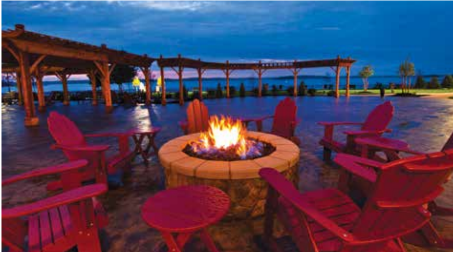
A welcoming fire pit at the 1000 Islands Harbor Hotel.